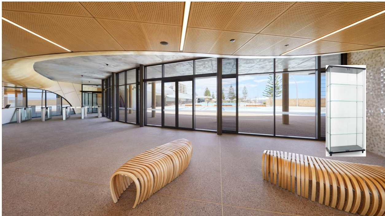
Entrance and Foyer- trophy cabinet display with sponsor’s details on display.